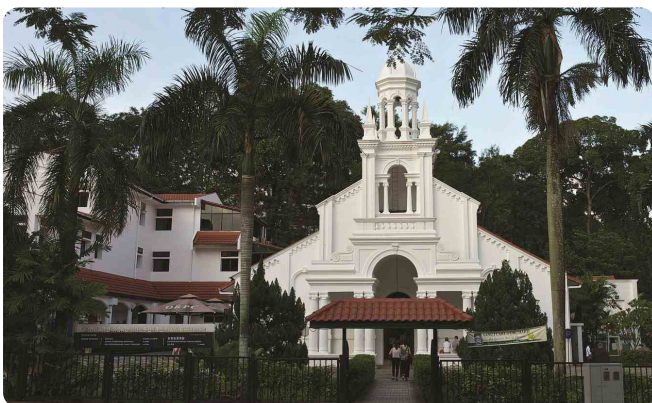
Current ORPC site with Dunman Extension

Since then, the size of the congregations of ORPC and Providence Presbyterian Church have grown. At the same time, the existing buildings require upgrading.