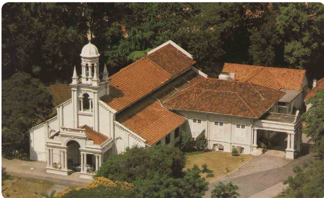
Previous ORPC site with Tomlinson Extension (Before Dunman Extension)

Over the years, new buildings have been added to the site. Tomlinson Hall was added in 1920, and the Chapel in 1953. The Dunman Building which currently houses the church offices, meeting rooms as well as Sunday school facilities was completed in 1985.